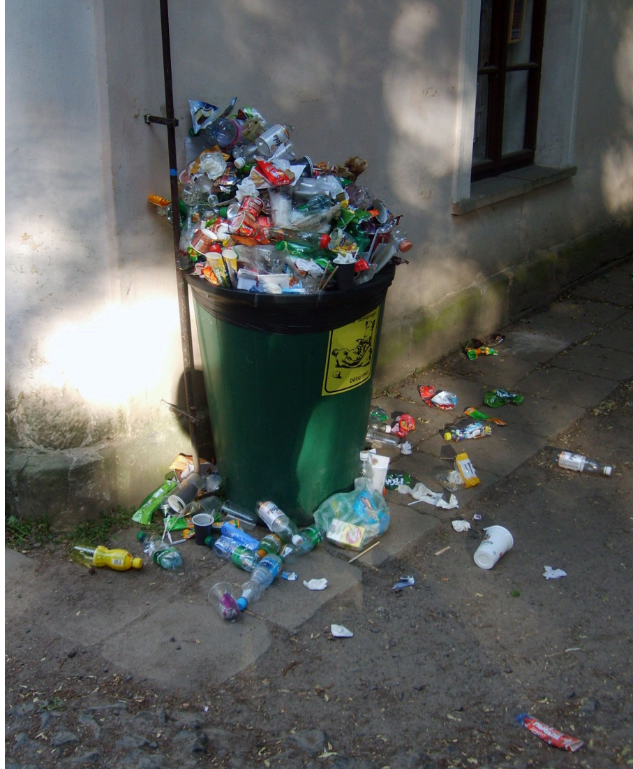
The Best Real Estate Lawyer