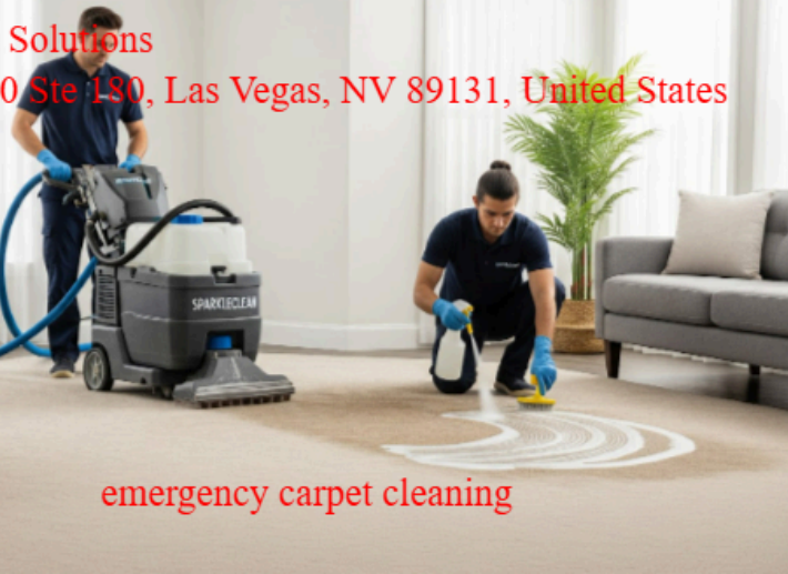
emergency carpet cleaning

Drying pace relies upon on airflow and pile density. In arid Las Vegas, reasonable warmth or AC combined with ceiling fanatics strikes moisture out. Crack windows merely if out of doors air is drier than indoor, that's ordinary an awful lot of the 12 months. Expect 6 to ten hours for so much rooms; stairs and basements, if provide, would possibly desire longer.