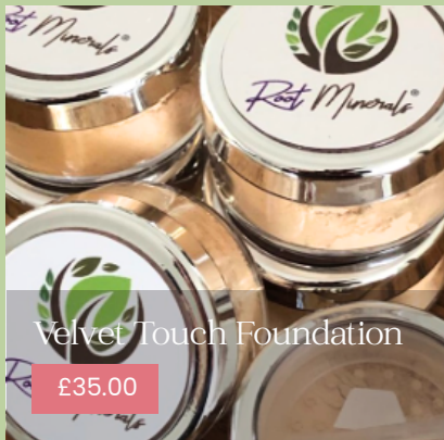
Velvet Touch Foundation