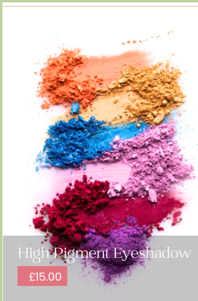
High Pigment Eyeshadow