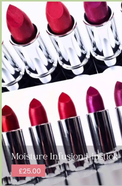
Moisture Infusion Lipstick