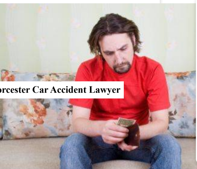
Worcester Car Accident Lawyer

ndanger your case. Do not settle for much less than you are entitled to--irect you via the procedure and supporter in your place. A quick settlement sing the situation before brand-new evidence surface areas.