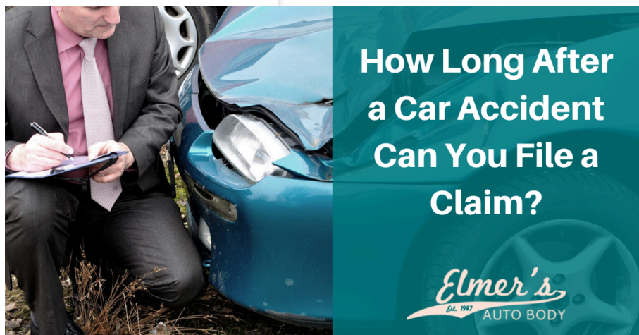
The Best Austin Accident Lawyer

Cars and truck mishap attorneys connect with insurance phone calls from insurance coverage insurers, both from information you supply about the case, the better they ca appropriate files, like cops records or medical document reports, witness declarations, photos, and in some cases need to spend for damages. This technique uses across v no matter the circumstance. If you miss out on the statu insurance claim, you might shed your right to go after compensation, even if you have a solid situation. That's why you need an automobile crash attorney asap after your crash. They'll file every one of your documentation properly and on schedule to protect your right to recuperation. Your car mishap attorney will prepare a need letter outlining responsibility and your damages, then talk with the insurance provider to work in the direction of an ideal negotiation figure. Also if the situation doesn't go to trial, showing that you prepare to prosecute can typically motivate the opposite to resolve even more favorably. This can make a vital distinction in cases