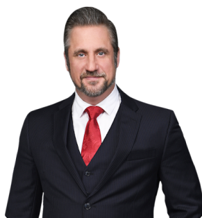
Fort Lauderdale, FL

The Elliot Legal Group P.A.- Real Estate & Business Lawyer