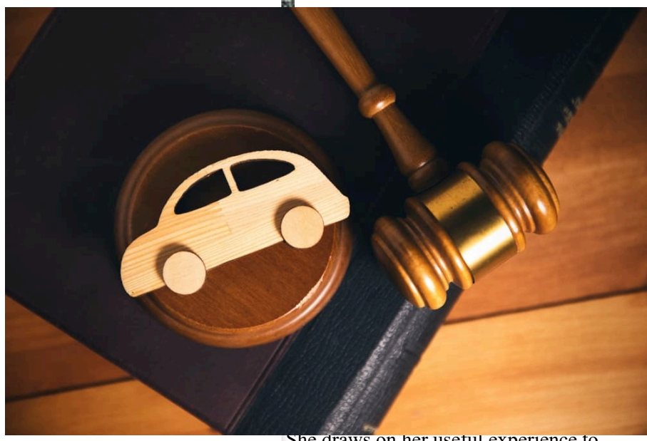
The Best Houston Car Accident Lawyer