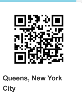
Queens, New York City