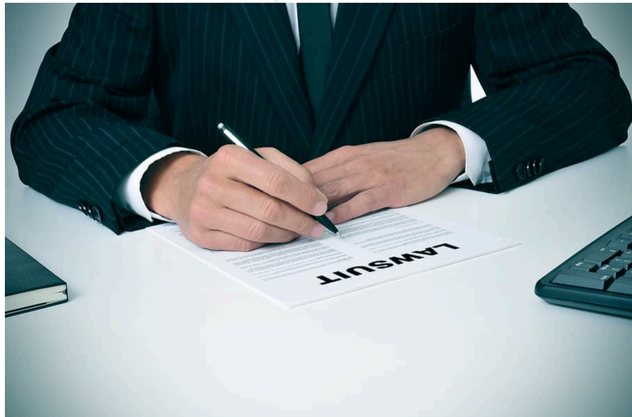
The Best Hartford Car Accident Lawyer

from beginning to end and do all the of life. Some attorneys use flat-rate prices ors, a great deal of home to divide, or other aim that the price of the lawyer is worth the