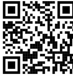
Los Angeles, CA