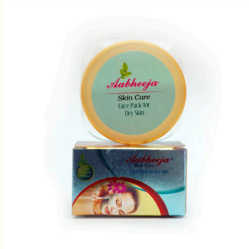
Dry Skin Facepack : Aabheeja