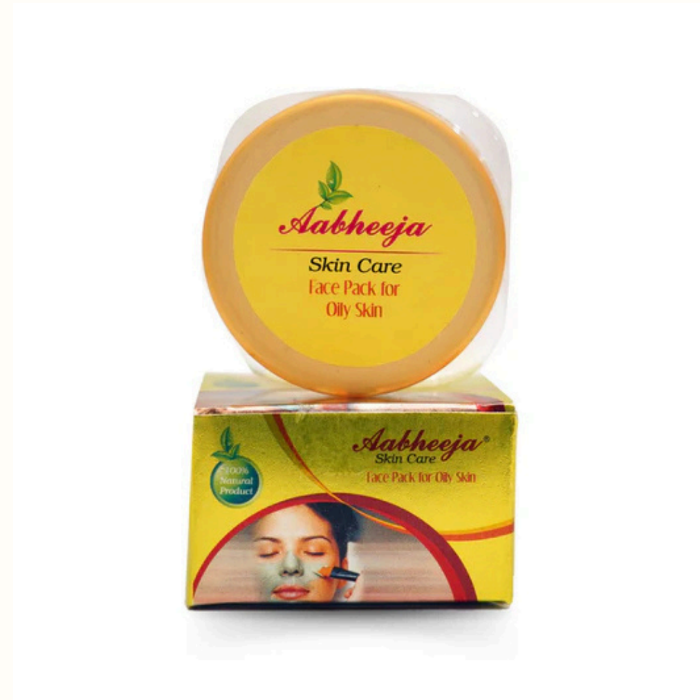
Facepack for Oily Skin – Aabheeja