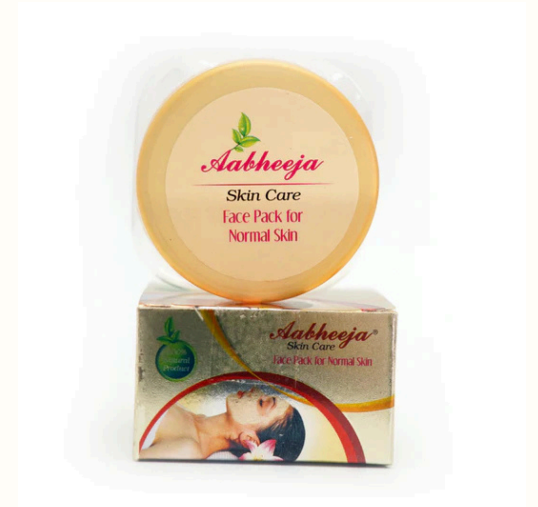
Normal Skin Facepack : Aabheeja