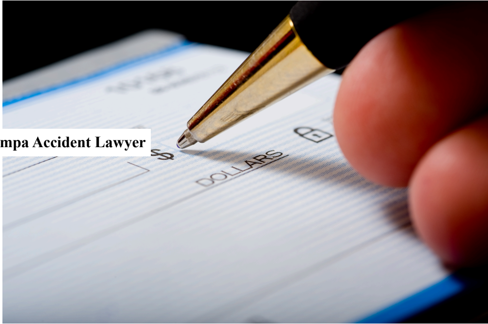
Tampa Accident Lawyer

to be individual. While we execute gy for every customer.