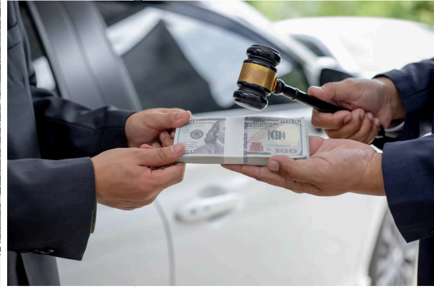
The Best Gainesville Car Accident Lawyer