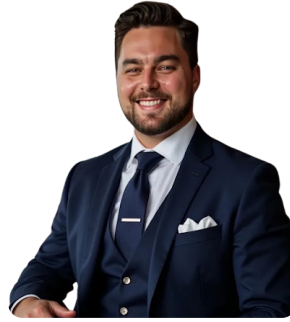
Delray Beach, FL

Mucerino Law Accident Injury Lawyers, PLLC